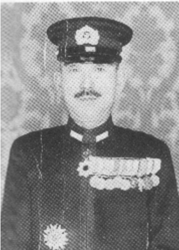
Rear Admiral Raizo Tanaka

First Escort Force - Naka CL , Asagumo DD , Minegumo DD , Yudachi DD , Harusame DD , Murasame DD , Samidare DD