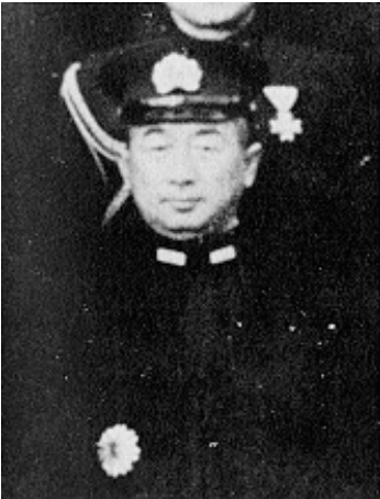
Rear Admiral Shoji Nishimura

With the opening of 1942 the unstoppable Japanese war machine is gathering pace. On 15 th February 85,000 British and Australian troops surrendered at Singapore, and the rest of the Malaysian peninsula followed quickly. Bali surrendered on the 18th, Timor a few days later. Next in line is the island of Java with its rich oil reserves. A two pronged attack is planned with landings at Kragan in the North East and in the west at Bantam Bay, Merak and Eretenwetan near the capital Batavia.